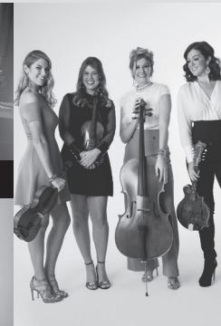
THE HALL SISTERS