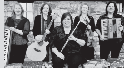
CHERISH THE LADIES